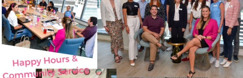
Happy Hours & Community Service