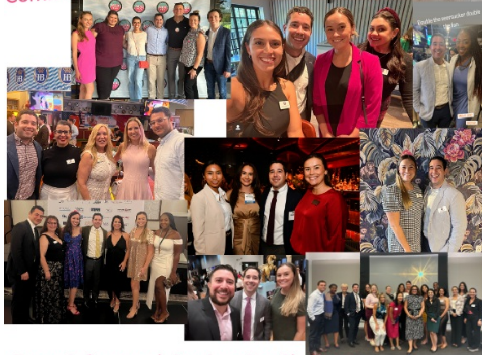
Breakfast with the Judiciary